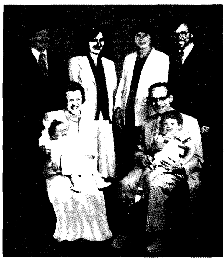
i) Nuclear Family